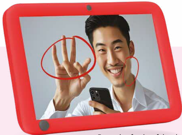
Example of a deepfake photo

Fake photos or videos made by Gen AI that look very real.